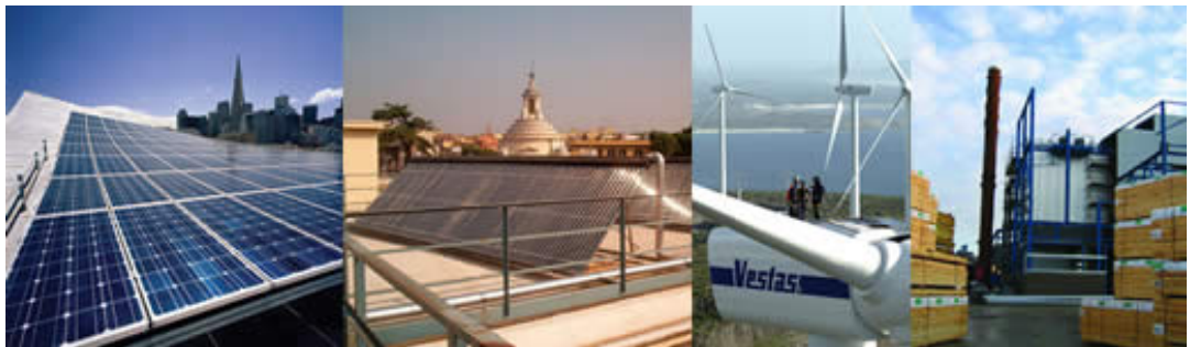
Renewable energy on the up LEFT TO RIGHT Rooftop PV in California Solar thermal collectors at a hospital in Rome, Italy Wind farm at Woolnorth, Australia Wood-fired Irish biomass plant

Approximately US$22 billion was invested in renewable energy worldwide in 2003 (see Figure 1). In comparison, total investment in the electric power sector is likely to be in the range of $120-160 billion/year (it varies substantially from year to year). Annual investment in renewable energy has grown almost fourfold from $6 billion in 1995, while cumulative investment since 1995 is in the order of $110 billion. The 2003 investment shares in the renewables sector were roughly 38% for wind power, 24% for solar PV, and 21% for solar thermal hot water. Small hydro power, biomass power generation, and geothermal power and heat made up the remaining 17%.